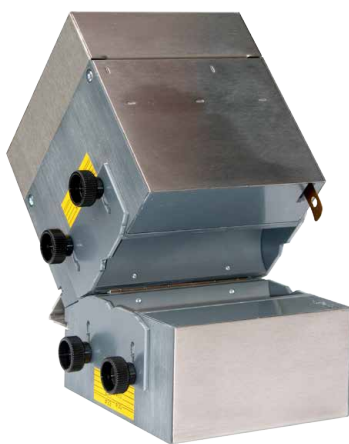
CVP 2200A, opened

The Capacitive Voltage Probe (CVP) is designed for measuring asymmetrical disturbances on cables with capacitive coupling principle. It gives the opportunity to do the measuring without disconnection of the tested cable ("in-situ") and it avoids the influence of the transmission. Main parameter of the CVP is the coupling factor, measured in a calibration system with 50 Ω impedance. The capacitive voltage probe is specified in chapter 5.2.2 and Annex G of CISPR 16-1-2.