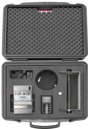
CVP 2200A, power supply, battery charger, calibration jig, RF cable and 50 Ω termination in suitcase